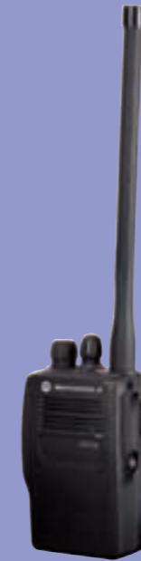
GP344R & GP644R

With the Motorola GP-R Series you can select the most suitable and cost-effective solution for the job with the confidence that full communication compatibility across the range is guaranteed. Whether it is simple "talk and listen" functionality or a more sophisticated requirement allowing the user to manage teams and production the GP-R Series fulfils the need.