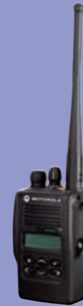
GP366R & GP666R